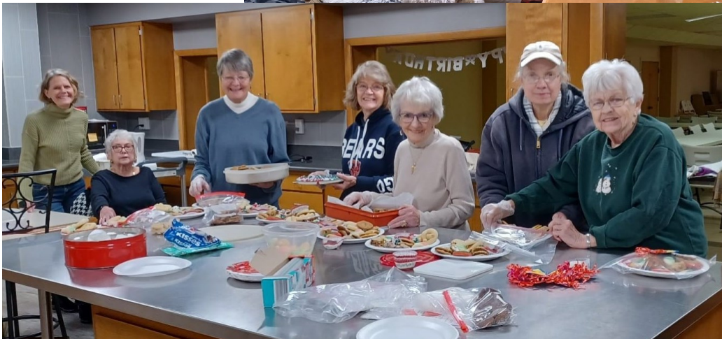
Left: MEMBER SUPPORT COMMITTEE PREPARING COOKIE PLATES FOR OUR SHUT-INS ON DECEMBER 17