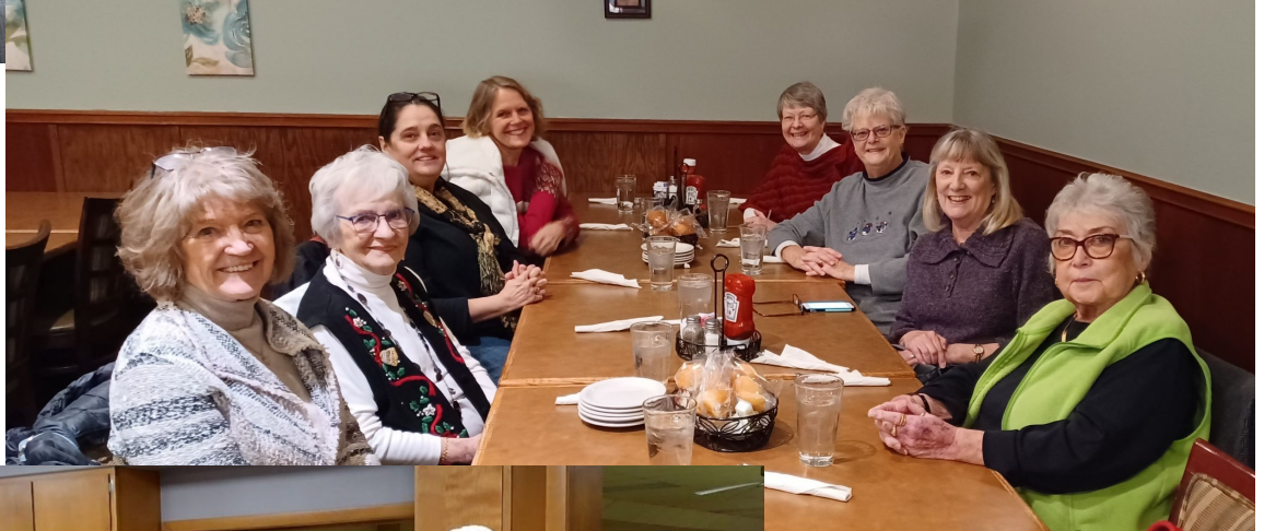
Right: LUNCH BUNCH ON DECEMBER 15