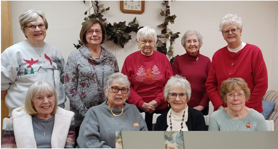
Left: RUTH UNIT CHRISTMAS PARTY ON DECEMBER 14