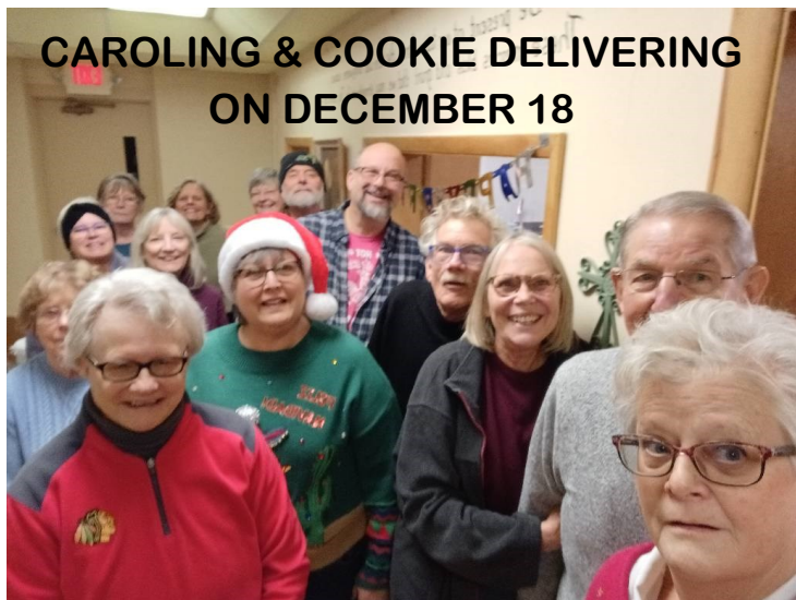
CAROLING & COOKIE DELIVERING ON DECEMBER 18