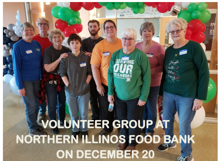
VOLUNTEER GROUP AT NORTHERN ILLINOS FOOD BANK ON DECEMBER 20