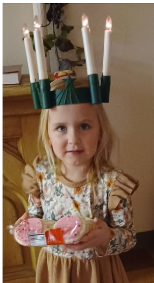
Right: SUNDAY SCHOOL CHILDREN LEARNED ABOUT SANTA LUCIA ON DECEMBER 11.