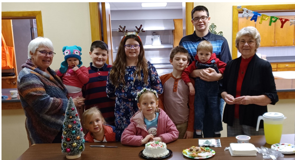
Left: SUNDAY SCHOOL "BIRTHDAY PARTY FOR JESUS" ON DECEMBER 18