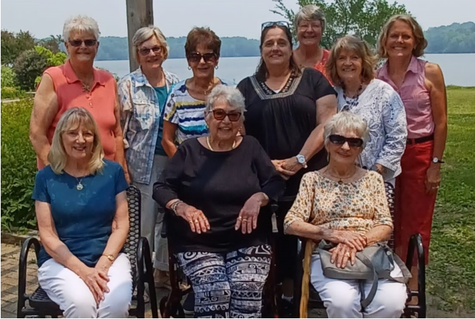
June Lunch Bunch at Pokanoka's Dockside Restaurant at Lake Shabbona