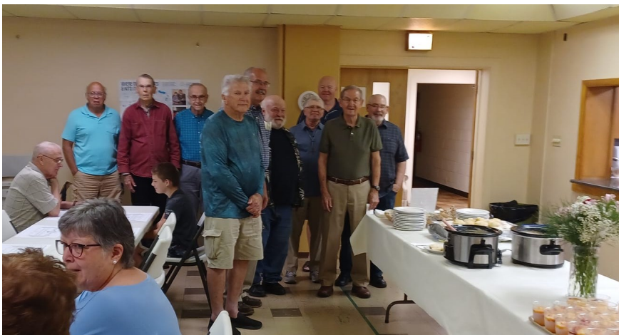
Above: These gentlemen are ready to enjoy a delicious Father's Day Brunch of biscuits and gravy hosted by the Christian Education Committee.