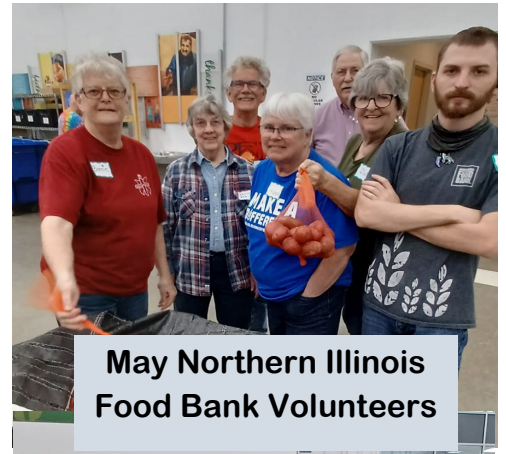
May Northern Illinois Food Bank Volunteers