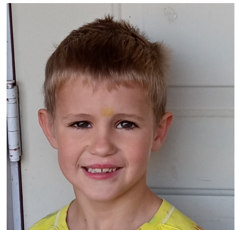
HUNTER communion bread baker