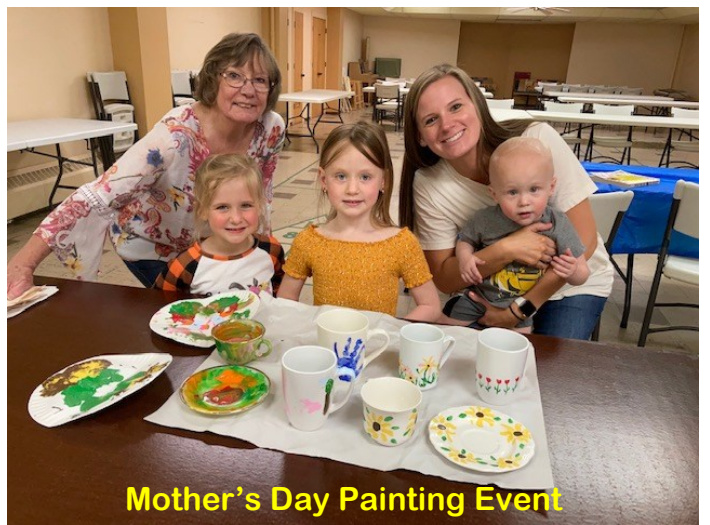
Mother’s Day Painting Event