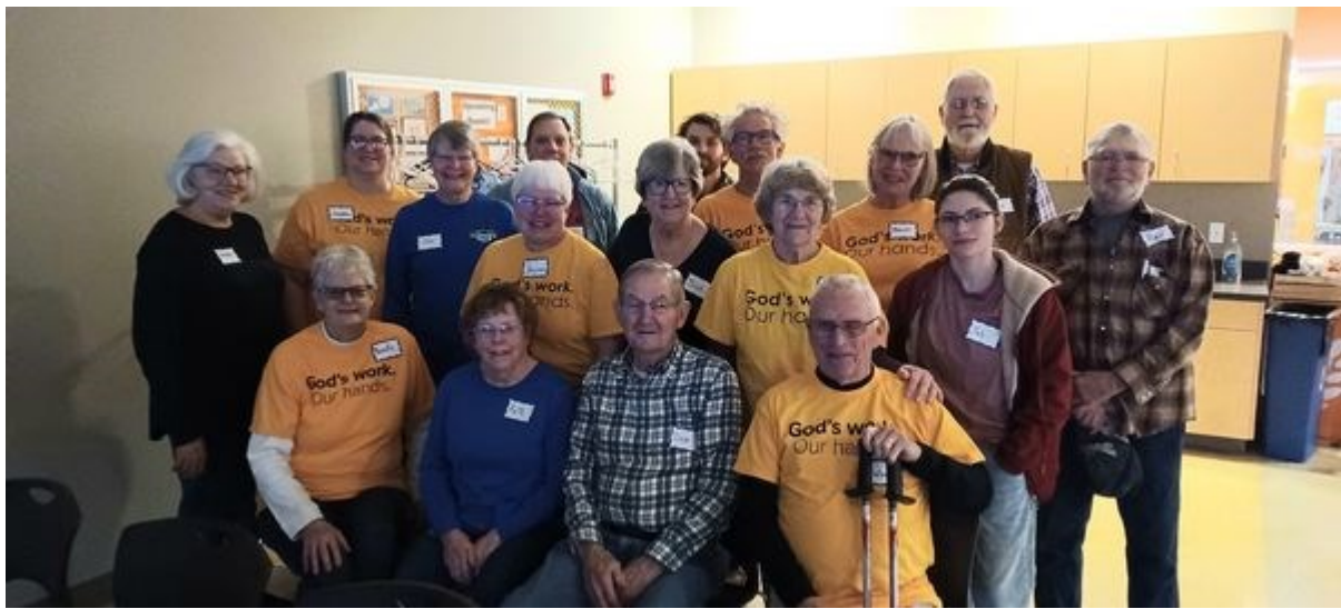
Above: Seventeen members of the Salem volunteer team packed 5,500 pounds of onions at the Northern Illinois Food Bank on February 20.