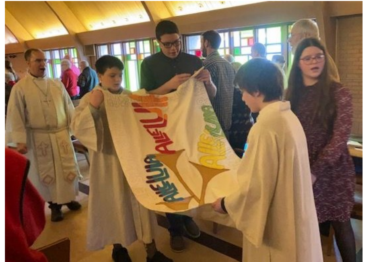
Above: Acolytes assist with saying "Farewell to Alleluia" prior to the beginning of Lent.

Below: Sunday School students enjoyed a Mardi Gras party complete with decorated masks and games on February 11.