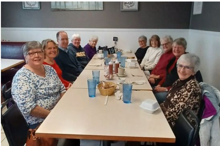
Above: Salem's Lunch Bunch enjoyed food and fellowship at the Somonauk Pancake House on February 15.