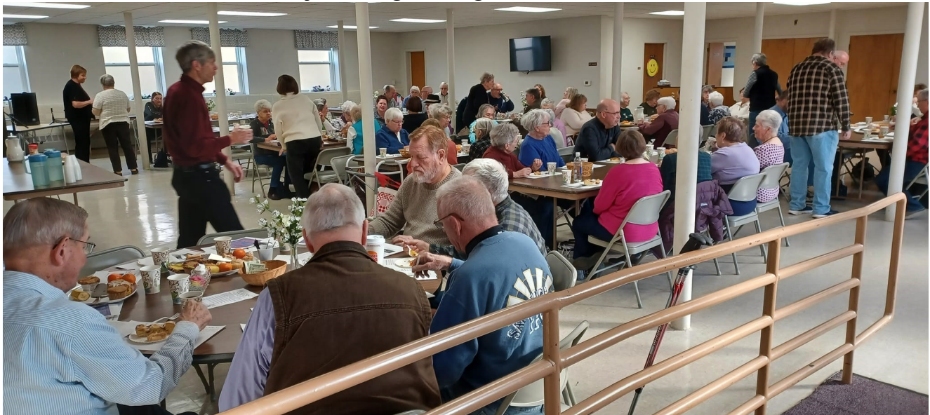
Below: Many Salem members have attended the Community Lenten Breakfast Series at the Federated Church on Wednesday mornings during Lent.